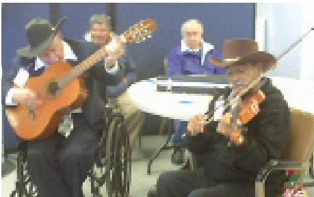
Two senior participants brought in their instruments and played Mariachi music.