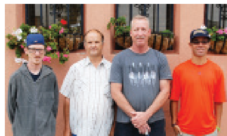
LSF SoCal program members take Getty Museum trip