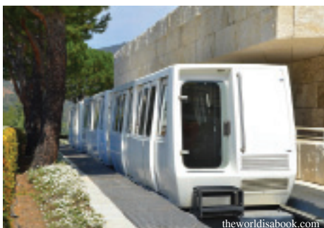
Getty Museum Tram

Seaside Learning Center, located in Long Beach, CA, is open daily and clients drop in all day long. Each day some of the clients are scheduled to visit a site around Southern California. These outings provide an opportunity for clients to learn more about the world around them, a chance to explore other neighborhoods, and expand their knowledge.