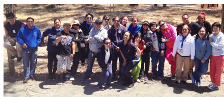
Clients from Social Dynamics enjoyed their Memorial Day BBQ at Coyote Point Park. Everyone played games, danced and enjoyed the beautiful day!

Located in Burlingame, CA, LSF Social Dynamics is a center-based program for adults who have developmental disabilities and severe behavioral challenges. Through community integration and reproducing a daily routine that strives to duplicate the daily routines of typical individuals, clients at Social Dynamics learn active and appropriate communication.