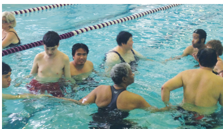
Social Dynamics group enjoy pool time at Redwood City YMCA.

collaboration between Social Dynamics and the Redwood City YMCA. The swimming teacher is trained to work with people with developmental disabilities.