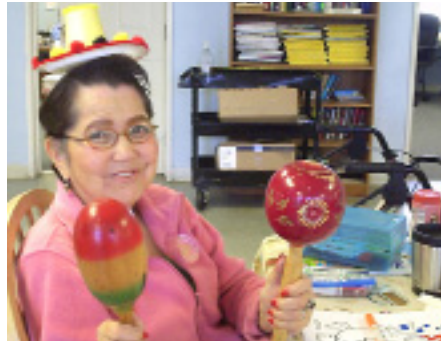
Participants made sombrero crafts and played along with the music.

their Mexican heritage to share. Viva Mexico! The Center provides services for adults and seniors with brain injuries, mental health diagnoses, developmental disabilities, and those with Alzheimer's and other dementias.