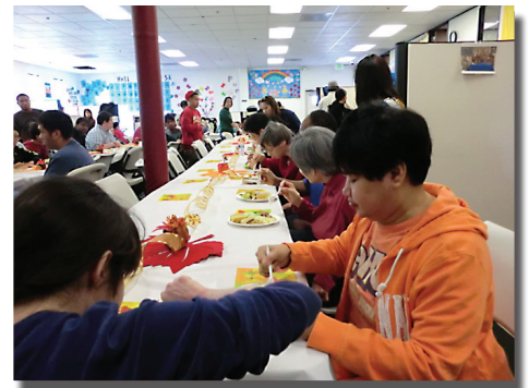
Social Dynamics clients enjoyed a Holiday Celebration luncheon with their family members and staff.

program, and is making plans to include the opportunity as part of initial intake for future clients.