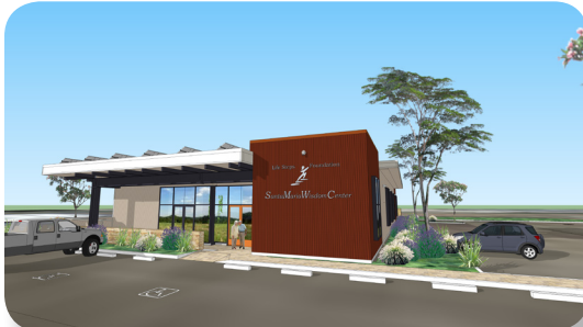
Design by Vivek Harris Inc